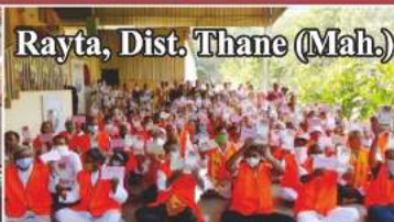
Rayta, Dist. Thane (Mah.)