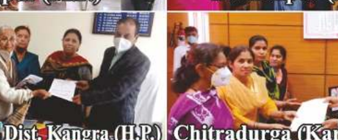
Palampur, Dist. Kangra (H.P.)